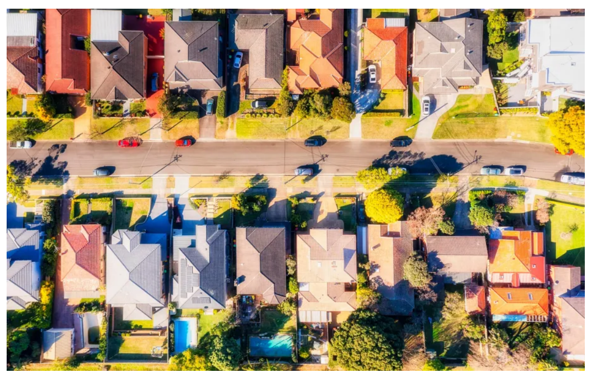
California has reinstated a law that allows homeowners to sell an additional dwelling unit separate from the primary residence.

Legally converting the home and the other living unit(s) to a two-unit or three-unit condo, for example, is now on the table.